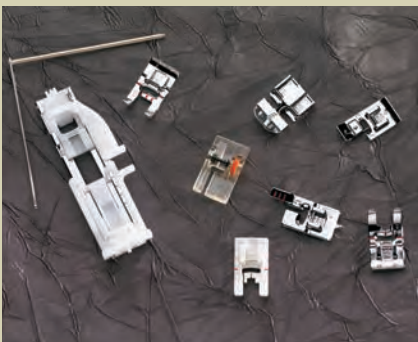
Presser feet EMERALD™ 118 and 116: Utility foot A, Decorative foot B, Buttonhole foot, Adjustable Blind Hem foot, Zipper foot E, Non Stick Glide foot H, Edging foot J, Edge/Quilting Guide, Automatic Buttonhole foot.