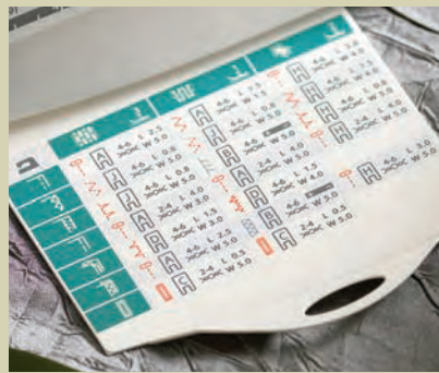
Need advice? Reach for your Sewing Guide Reference Chart! Your EMERALD™ features a simplified Sewing Guide Reference Chart that helps with the right settings. Pull it out from the base of the machine.

EMERALD™ 118 creates 70 stitch functions.