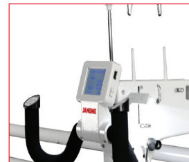
Adjustable Front and Rear Handlebars