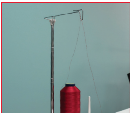
Built-in Telescoping Thread Stand